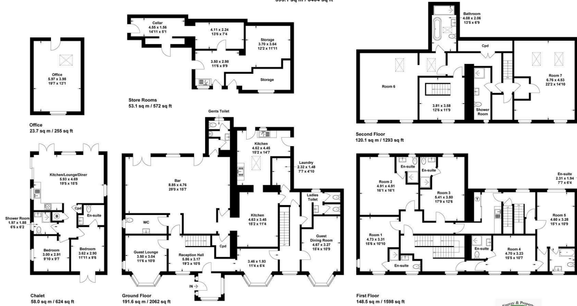
Illustration for identification purposes only, measurements are approximate, note to scale.